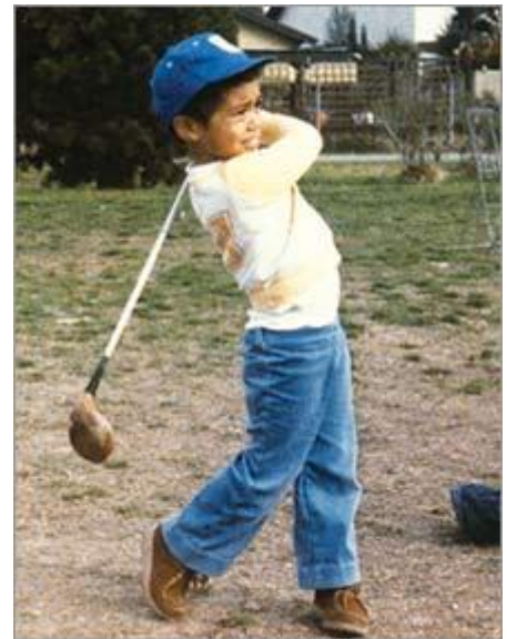
Born Winner? Golf champ Tiger Woods (pictured at 3 years old) never stopped trying to improve